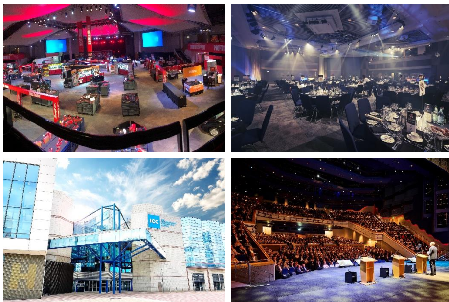
International Convention Center ICC The ICC, 8 Centenary Square, Birmingham, B1 2EA www.theicc.co.uk